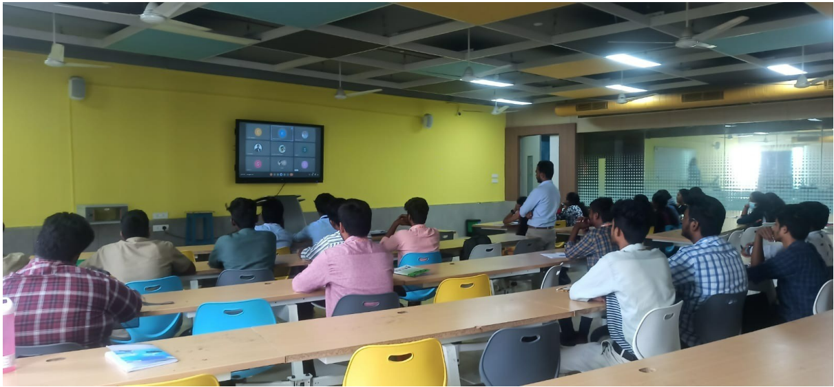
Online Session @ SDC Block 405, KLEF