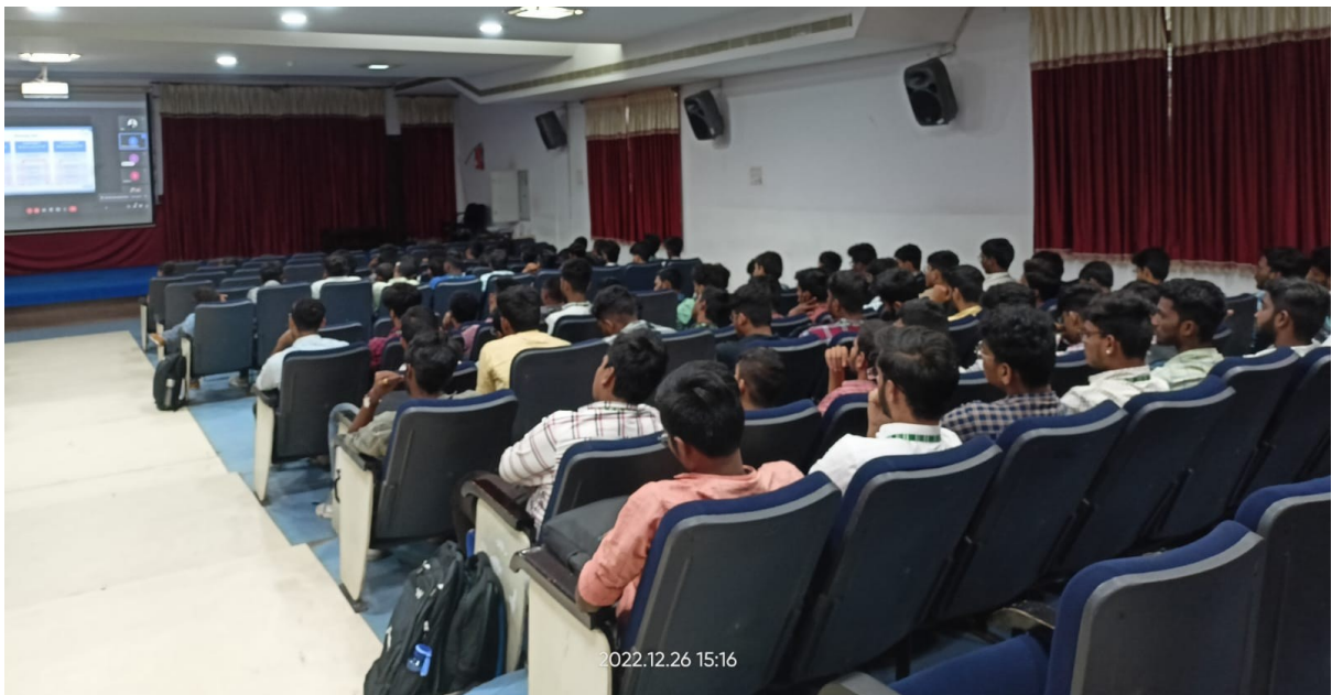
Online Session @ Peacock Hall, KLEF