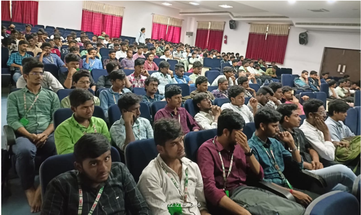
Online Session @ Peacock Hall, KLEF