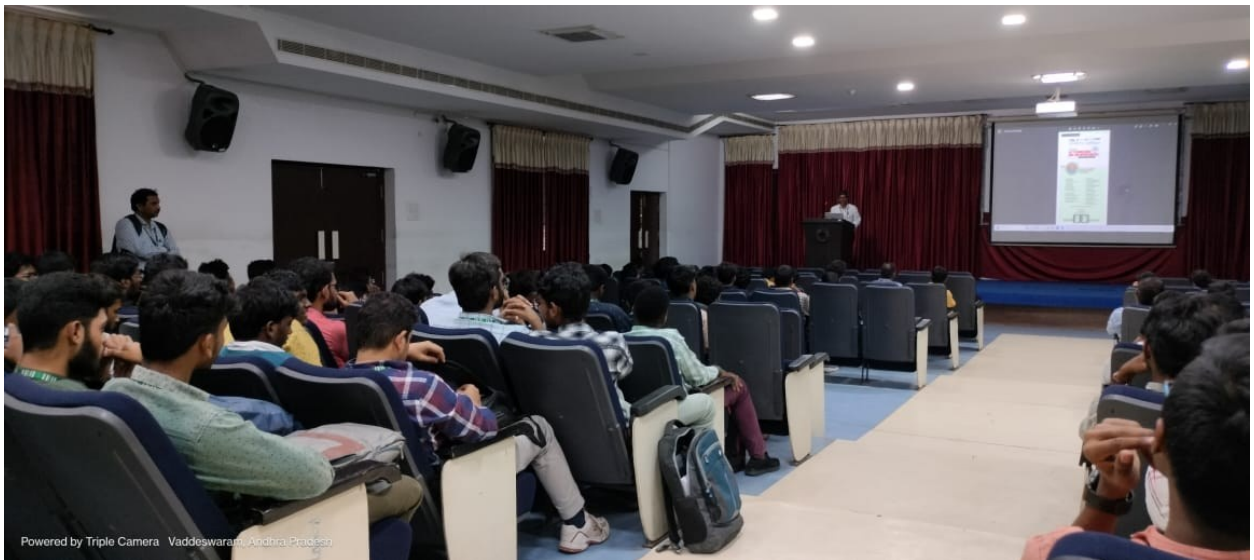
Online Session @ Peacock Hall, KLEF