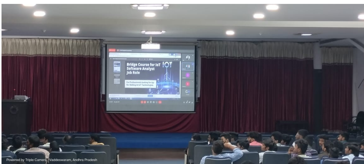
Online Session @ Peacock Hall, KLEF